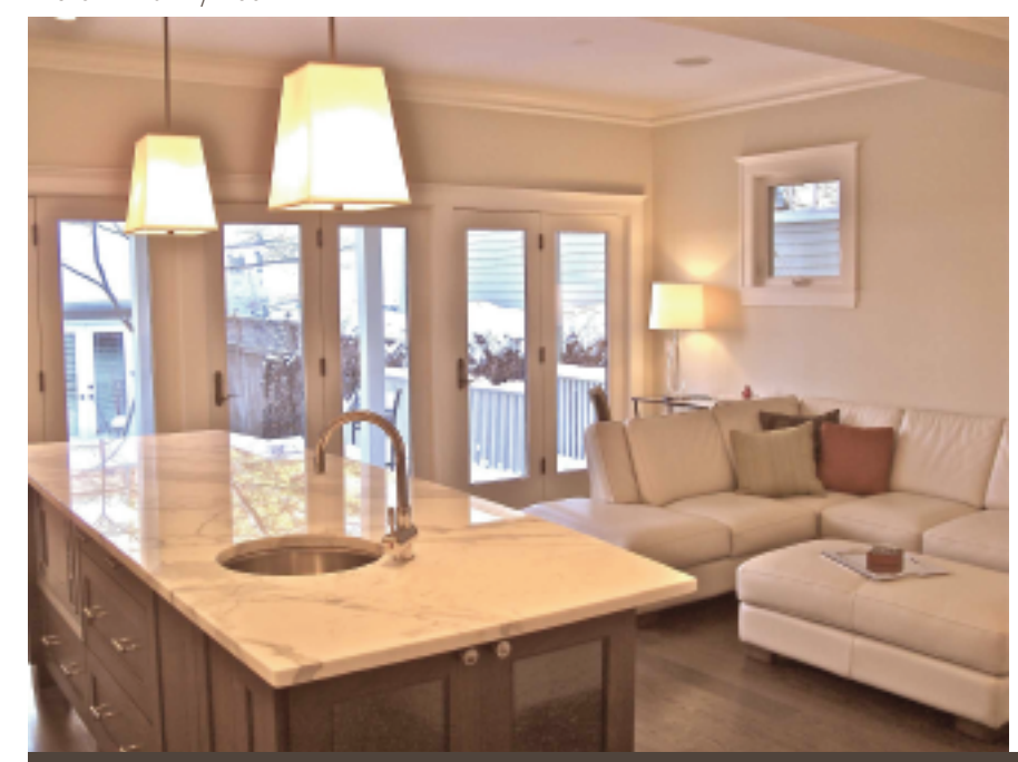
Kitchen + Family Room