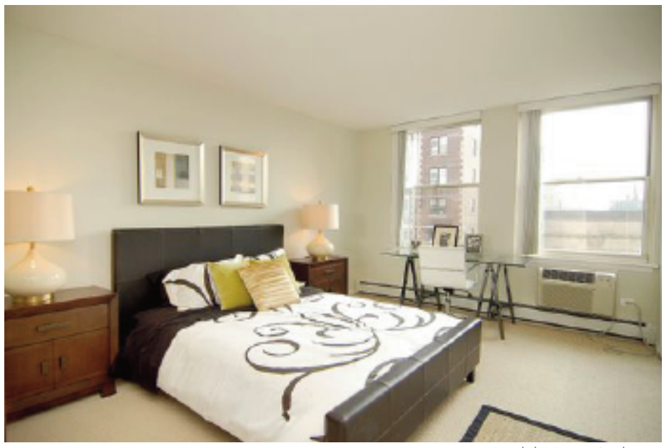
Model Master Bedroom