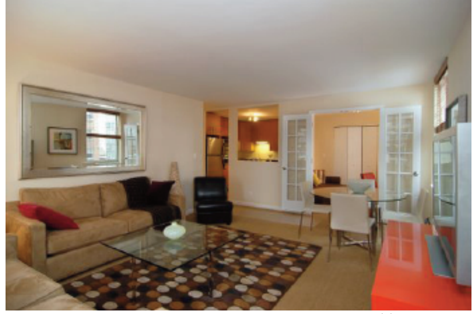
Model Living + Dining